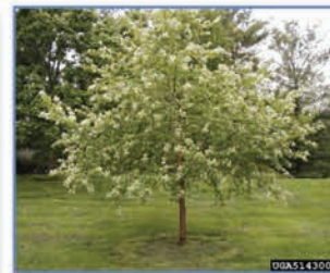
Amur Chokecherry ( Prunus maackii ) Showy white flowers and beautiful copper-colored exfoliating bark. Produces small black fruits that can be used for jams or jellies.

Other varieties for Alaska: M.x ranetka, M. x 'Selkirk'