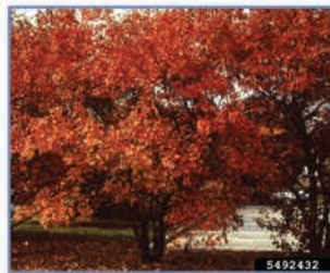
Amur Maple ( Acer ginnala ) Brilliant fall color, produces small white flowers and winged seeds.

*Be sure to choose a variety that corresponds with your hardiness zone. Contact the Alaska Community Forestry Program with questions.