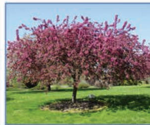
Crab Apple ( Malus spp.) Cultivars vary in flower color as white, pink, or maroon. Many have great fall colors & produce sweet fruit for jelly or sauce.

Other varieties for Alaska: M.x ranetka, M. x 'Selkirk'